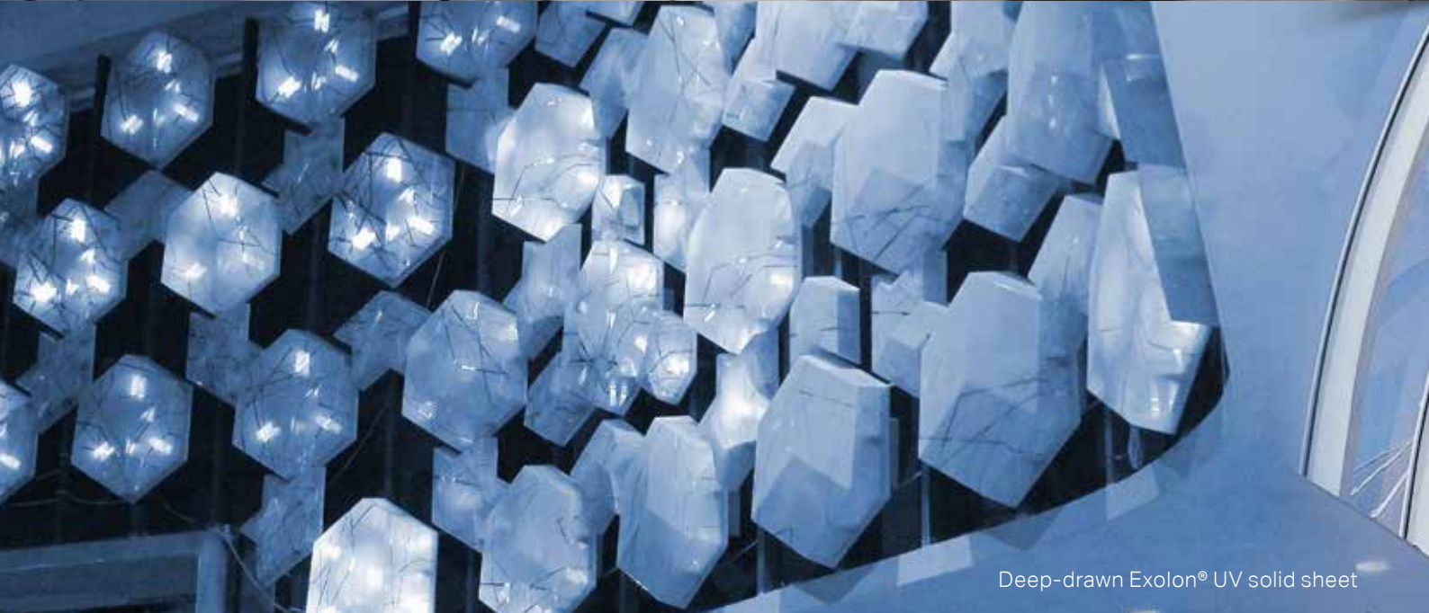
Deep-drawn Exolon® UV solid sheet