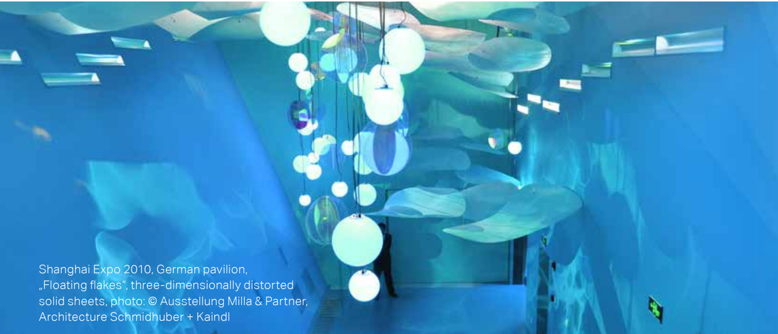
Shanghai Expo 2010, German pavilion, „Floating flakes“, three-dimensionally distorted solid sheets